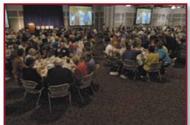
Dedicated table hosts made the 2005 luncheon the best attended to date.