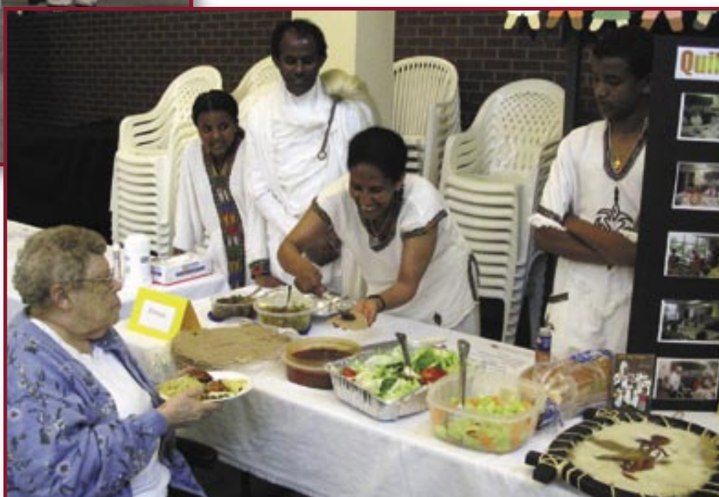
An Eldercare resident enjoys Ethiopian cuisine at a luncheon during Heritage Celebration Week.