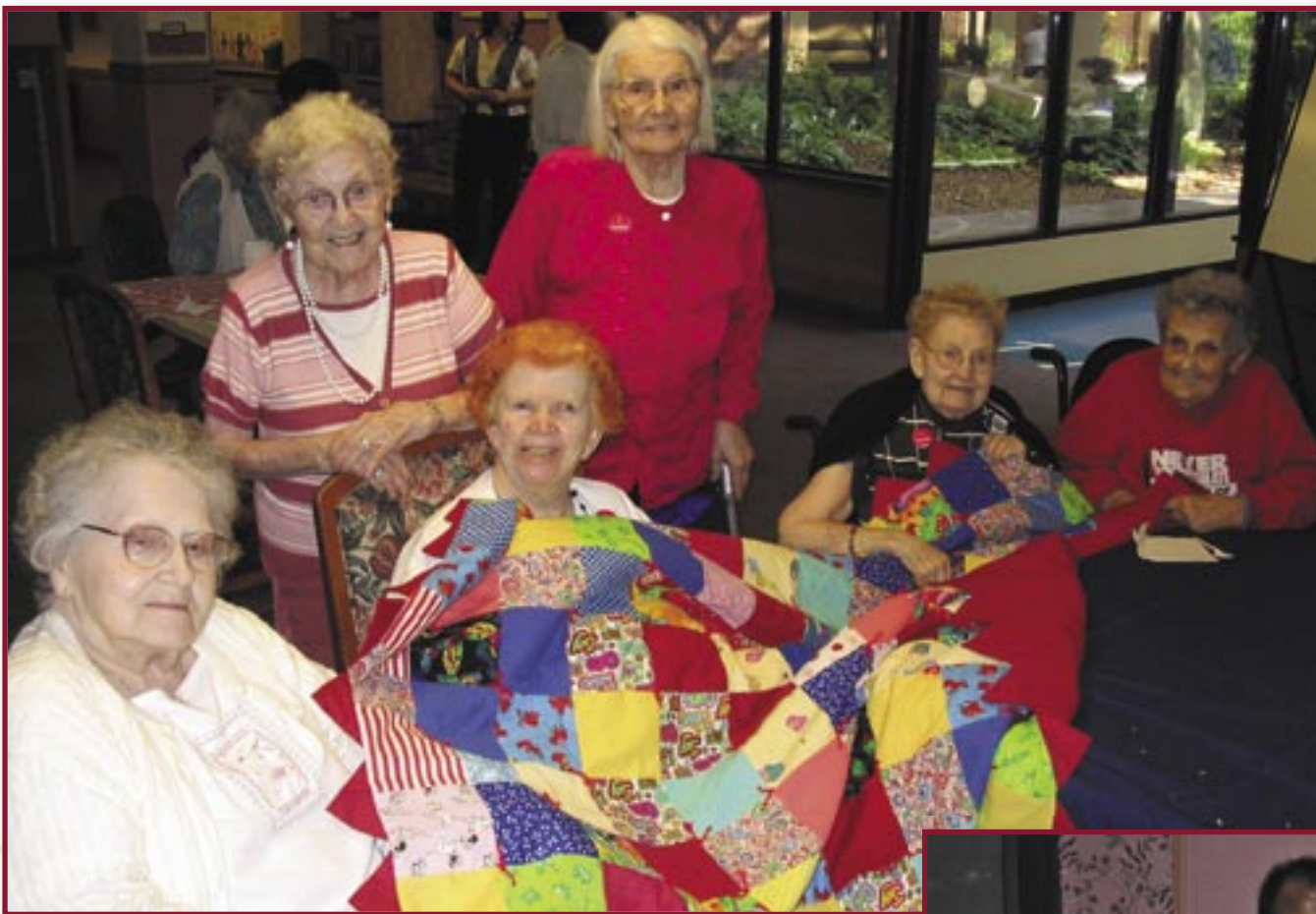
A group of Eldercare residents show off one of the quilts they helped create for immigrant families new to Northeast Minneapolis.