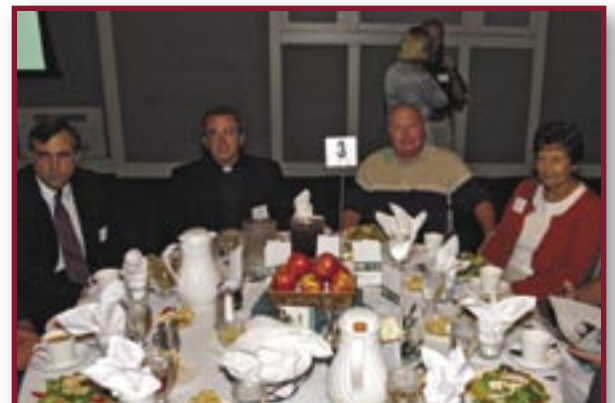
More than 560 supporters attended the fall luncheon