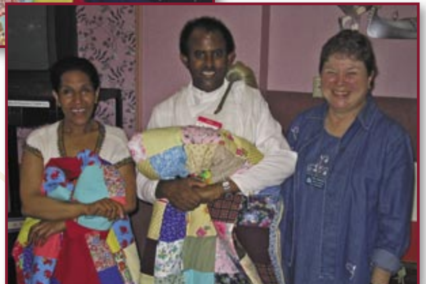
This Ethiopian family was deeply moved by Catholic Eldercare’s generosity.